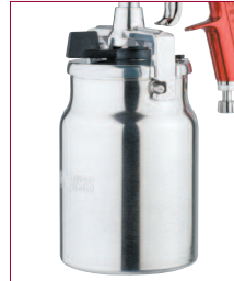
Suction cup pt. no. TGC-545-E-K

JGA and GFG HD spray guns are packaged as pressure gun only, suction gun kit includes 1 litre cup and gravity kits include the 568 ml standard gravity cup.