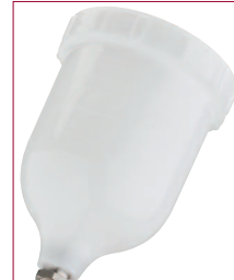
Gravity cup pt. no. GFC 501