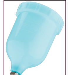
Gravity cup (Blue polyester) pt. no. GFC 511 for difficult fluids.