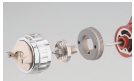
JGA HD Pressure Fluid Tip/Needle (mm) size and code: 0.85, 1.0, 1.2, 1.4, 1.6, 1.8 JGA HD Suction Fluid Tip/Needle (mm) size and code: 1.6, 1.8 GFG HD Gravity Fluid Tip/ Needle (mm) size and code: 1.4, 1.6, 1.8